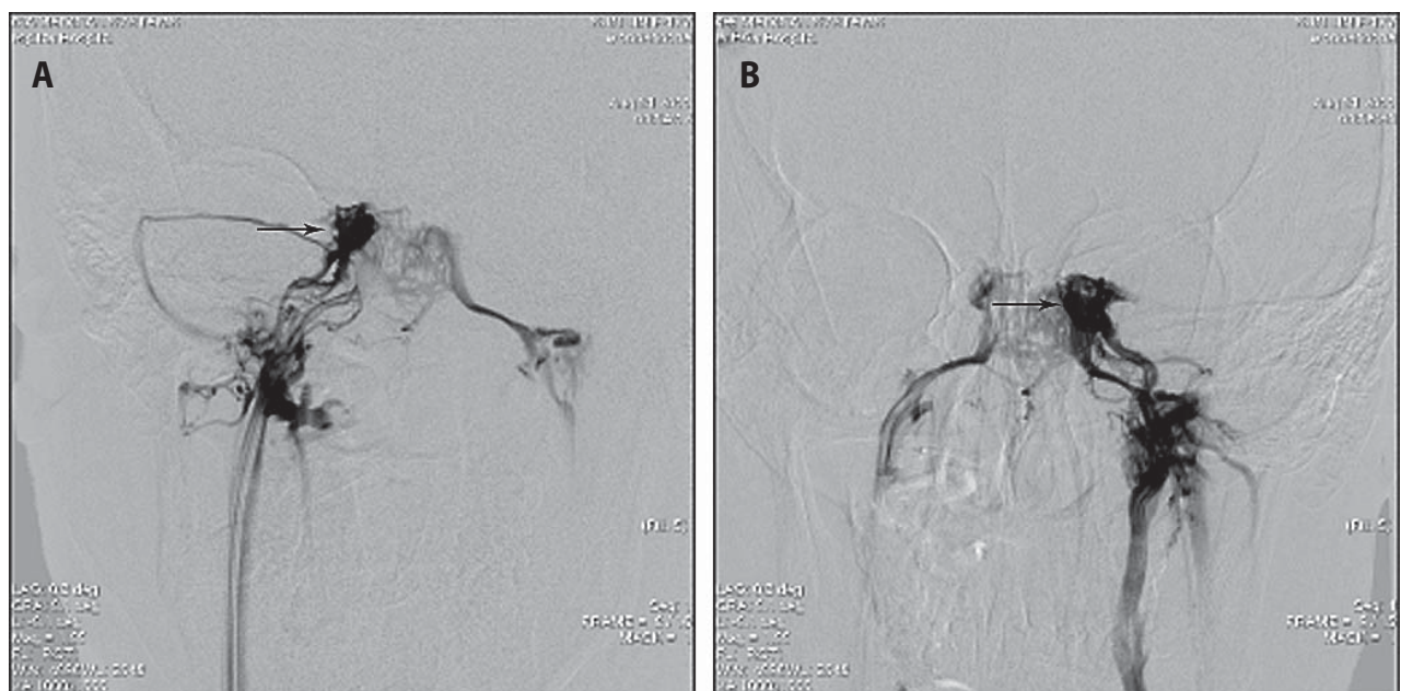
Fig. 1. Catheterization with 5Fr and 4Fr (RF*GA35153 m, 0.035", TERUMO Co, Tokyo, Japan). A - Right, B - Left.

BIPSS was performed with a plate DSA system (Innova, General Electric Medical System, Milwaukee, WI, USA), insert with the guide wire, after systemic anticoagulation with heparin and sedation, the needle and wire are exchanged for a venous sheath and repeat it on the opposite side. After catheter placement, position was verified in each case by injection of contrast agent (Crapo 1979). Under the fluoroscopically-guided catheterization was performed, with 5Fr and 4Fr (RF*GA35153 m, 0.035", TERUMO Co, Tokyo, Japan) inserted percutaneously into the right and left inferior petrosal sinus respectively (shown in Figure 1). 1~2 ml contrast material was softly injected by hand to obtain digital subtraction venograms of both petrosal and cavernous sinuses to assess the precise location of the catheter tips. All patients both petrosal sinuses were successfully catheterized, ACTH level was measured by an immunoradiometric method (CIS bio international, Gif/Yvette, France; with intra- and interassay CVs < 14% and < 20%, respectively) in 2 milliliter blood obtained