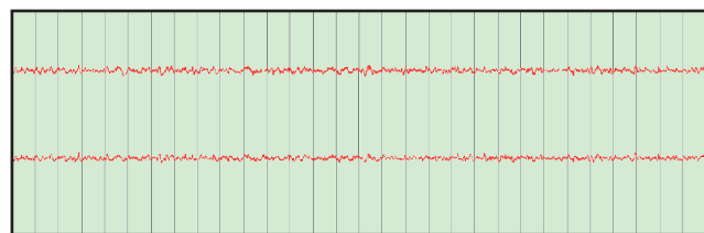
Fig. 3. EEG recordings in one rat pre-treated with ETX (200 mg/kg).

(Chuang et al. 2009), and that antiepileptic drugs such as valproic acid counteract such an effect (Brandt et al. 2006). Further studies should focus on veratridine induced seizures in the contexts of these findings.