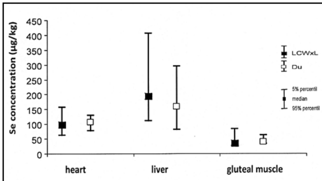
Figure 1. Distribution of concentration of sow serum Se for groups LCWxL and Du in time. Above each couple there is a statistical significance of difference (p-value, Mann-Whitney U test).